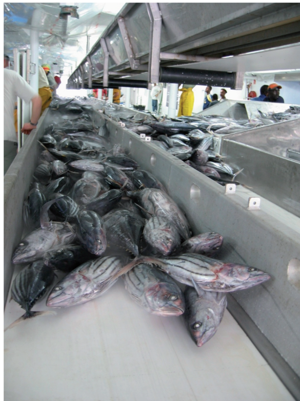
Fig. 6. Double conveyor belt to release non-target species (AZTI)