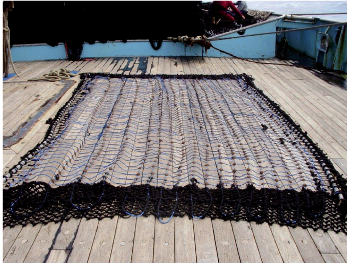
Figure 3. Sorting grid used in Ecuadorian and associated fishing vessels (Arrue's System)

Although purse seine is also an active fishing gear, the behaviour of the fish inside the net is very different when compared to other fishing gears, and it is accepted among the scientific community and fishers that the fish need an extra stimuli to go through the sorting grid.