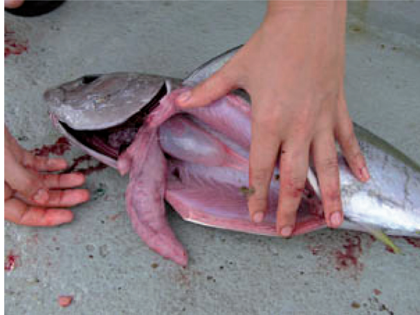
Figure 4. Position of the swimbladder in tuna fish (AZTI)