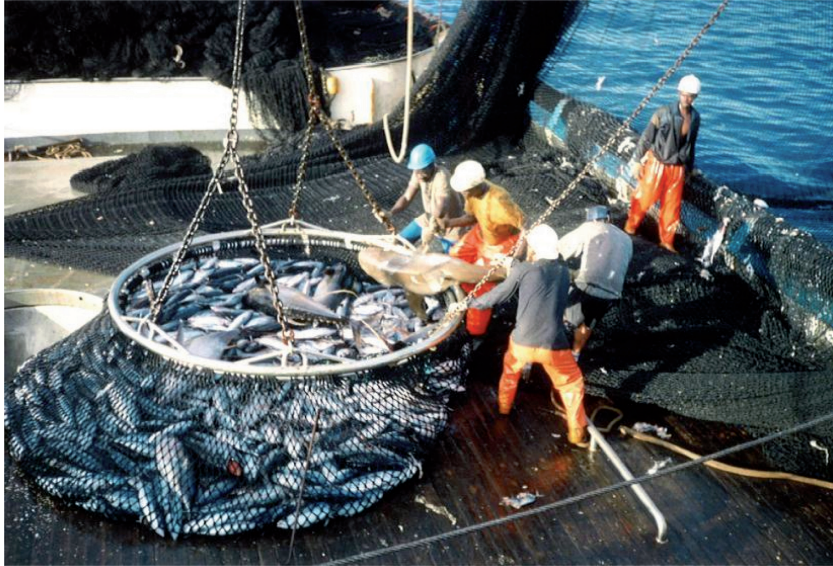
Fig. 5. Taking a shark out from the brailer