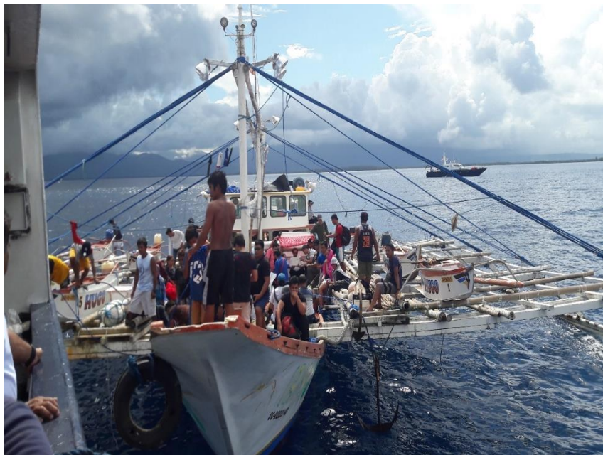
Figure 4. Examples of Philippine vessels using the large-fish Handline gear

Historical NSAP data (Table A2) show that the proportion of fishing with this gear within and outside archipelagic waters (AWs) and territorial seas (TS), has fluctuated over time and no doubt is related to availability of large-fish fish close to landing sites, access to certain fishing grounds, sea/weather conditions and other determinants (i.e. over the past decade, the percentage of catch outside AWs/TS has fluctuated in the range 20% to 95%, mainly depending on access weather, fishing conditions and access to waters outside the AWs).