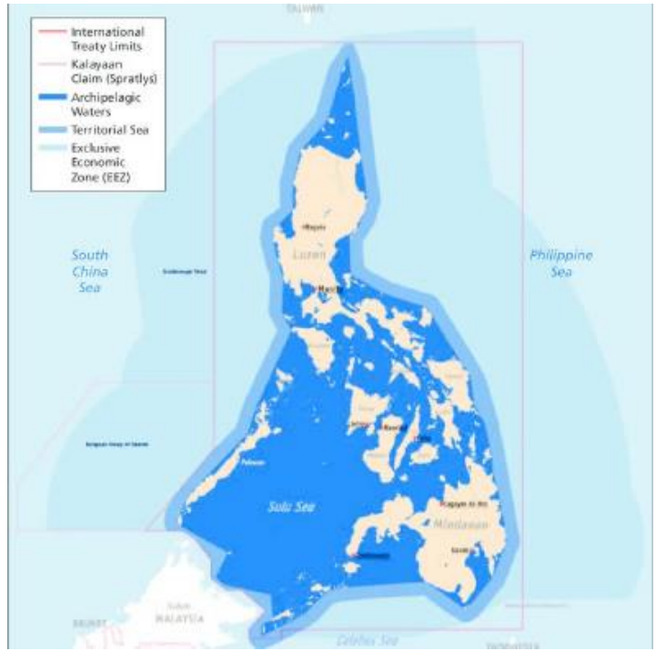
Figure 1. Map of the Philippines, including Archipelagic waters, territorial seas and EEZ areas.