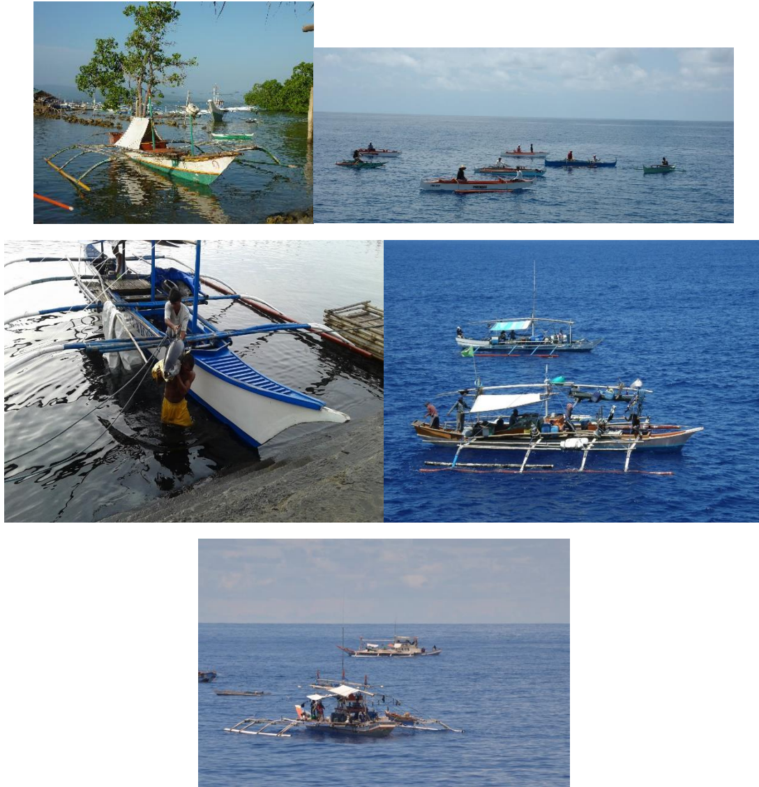
Figure 3. Examples of Philippine vessels using the hook-and-line gear

The annual catch estimates for this fishery are shown in Table A1 in the ANNEXES and have fluctuated between 20,000 t. and 32,000 t. over the past five years. Prior to the specific attention to annual catch estimates in this fishery through The Philippines National Stock Assessment Project (NSAP) Data Review workshops and Philippines Annual Catch Estimates workshops conducted with support from the WCPFC/WPEA, there was some uncertainty in the available catch estimates for this fishery; that is, estimates for years prior to 2014 are considered to be less reliable than estimates since 2014.