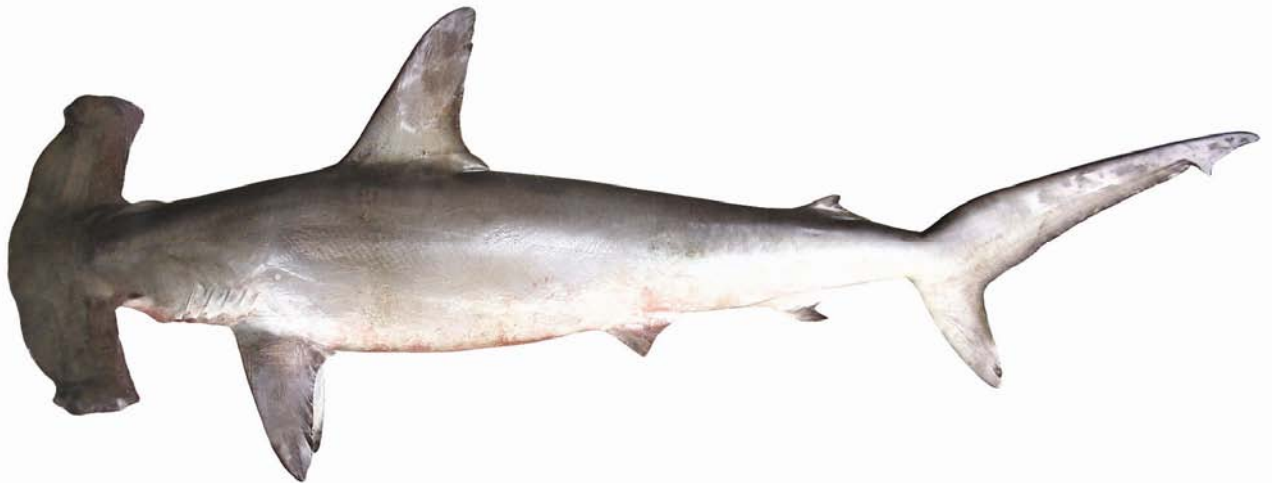
Figure 1 Sphyrna zygaena