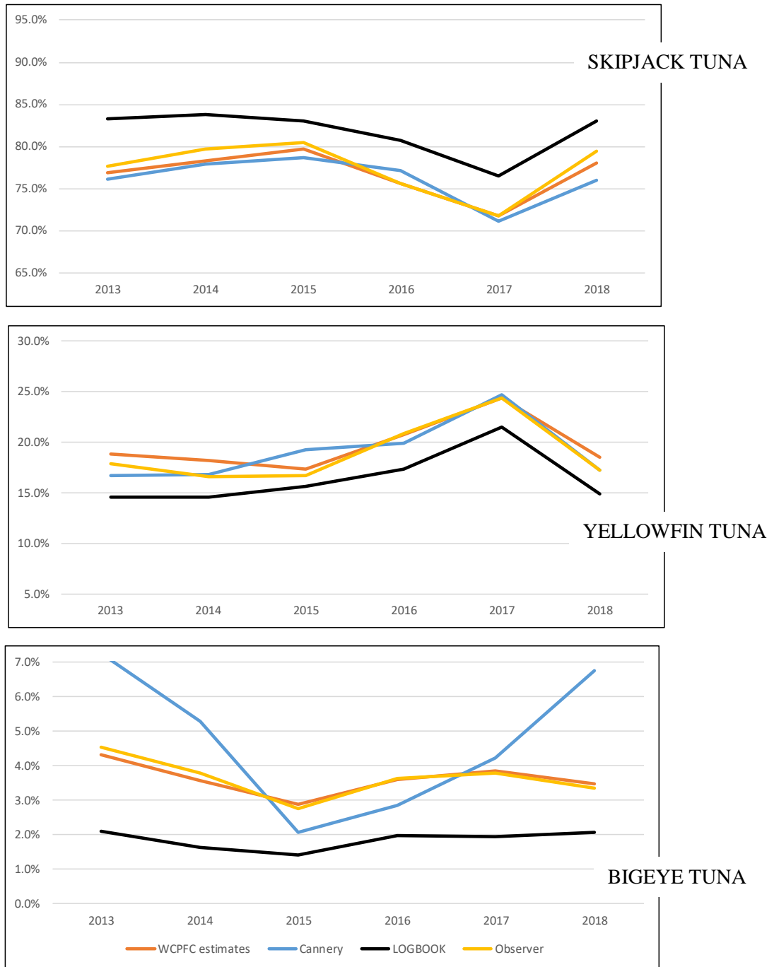
Figure 1. Purse seine tuna species composition by source of data, including adjusted cannery data.

WCPFC Estimates: Estimates of WCPFC tropical purse seine fishery catch, excluding Indonesia, Philippines and Vietnam domestic fisheries. Catch is estimated according to Lawson 2007, Lawson 2010, Lawson 2013.