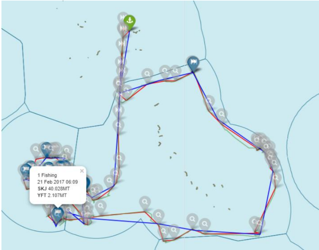
Figure 1. Example of Tufman 2 MAP feature, overlaying observer, logsheet and VMS data for a selected purse seine trip