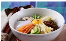
Bibimbap, Dolsot bibimbap

Bibimbap is served as a bowl of warm white rice topped with NAMUL (sautéed and seasoned vegetables) and GOCHUJAN (chili pepper paste sauce). The ingredients are stirred together thoroughly just before eating.