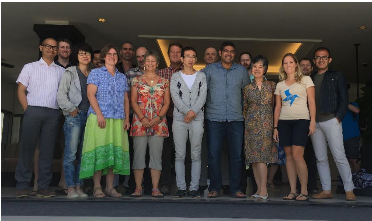
Figures 2a and b: Team photograph including all the participants from each workshop (a – Kruger National Park; b – Hoi An). Additional images are available on request.