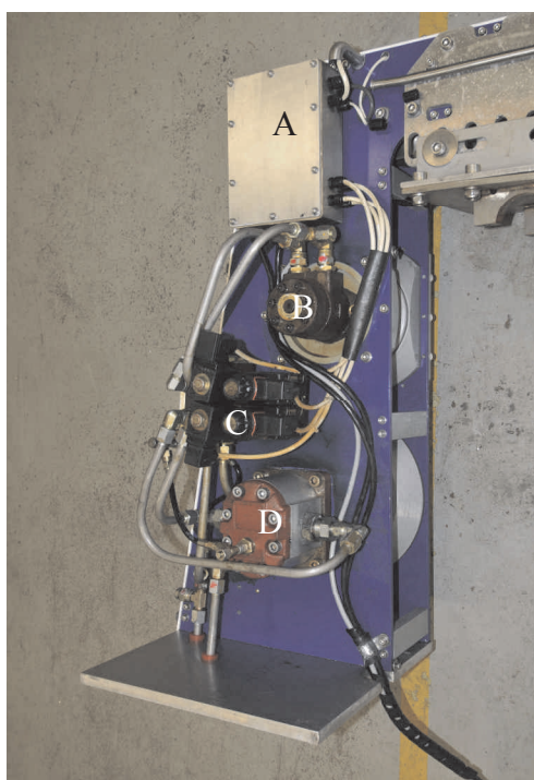
Figure 2. The drive system of the underwater setter. Shown are the control box (houses the PLC, data recorder and GPS; A), recovery motor (B), solenoid and relays (C) and pull-down motor (D). The on/off button and brake and timer are on the other side. The pulleys holding the spectra rope are barely visible beneath the hydraulic motors.