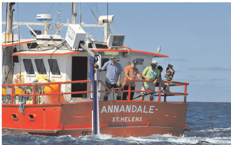
Figure 1. The latest configuration of the Mark 1 underwater setting machine being trialled off eastern Australian in January 2010. The hydraulics and control box are mounted on the roof to reduce the number of pulleys involved in connecting the hydraulic motors to the capsule. Fewer pulleys increase the transfer of energy from hydraulic motors to the capsule, which increases depths attained for a given cycle time.