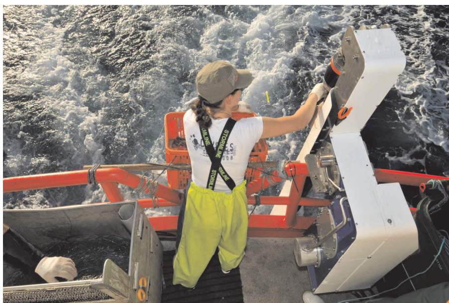
Figure 4. Operating the machine involves two steps – placement of baited hook in capsule and firing the release button on cue from vessel audio beep timer. The release button is the small cylindrical object beneath and slightly to the right of the deckhand's elbow.