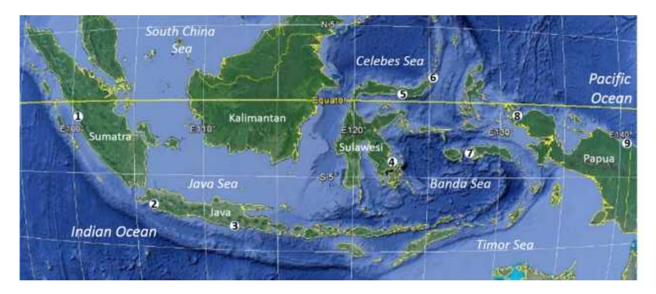
Figure 1. A map showing the Indonesian sampling locations: (1) Padang, (2) Prigi, (3) Palabuhanratu, (4) Gorontalo, (5) Kendari, (6) Bitung, (7) Ambon, (8) Sorong, and (9) Jayapura. (Modified from Google Maps).

Dissections of gills and stomachs were carried out according to the methods of Lester et al. (2001). After scanning the external surface, the gill cover was removed and the gills taken out by dorsal and ventral cuts. The gill arches were opened and the external and internal gill surfaces examined under a dissecting microscope to find didymozoids. The viscera were separated into stomach, pyloric caeca, intestine and liver. It was best to open each of these organs separately in an appropriately-sized petri dish and to examine it progressively under a dissecting microscope electron. Separation of organs allowed for a cleaner examination and also for the accurate recording of the site of infection. Any parasites found were removed and preserved in 70% alcohol.