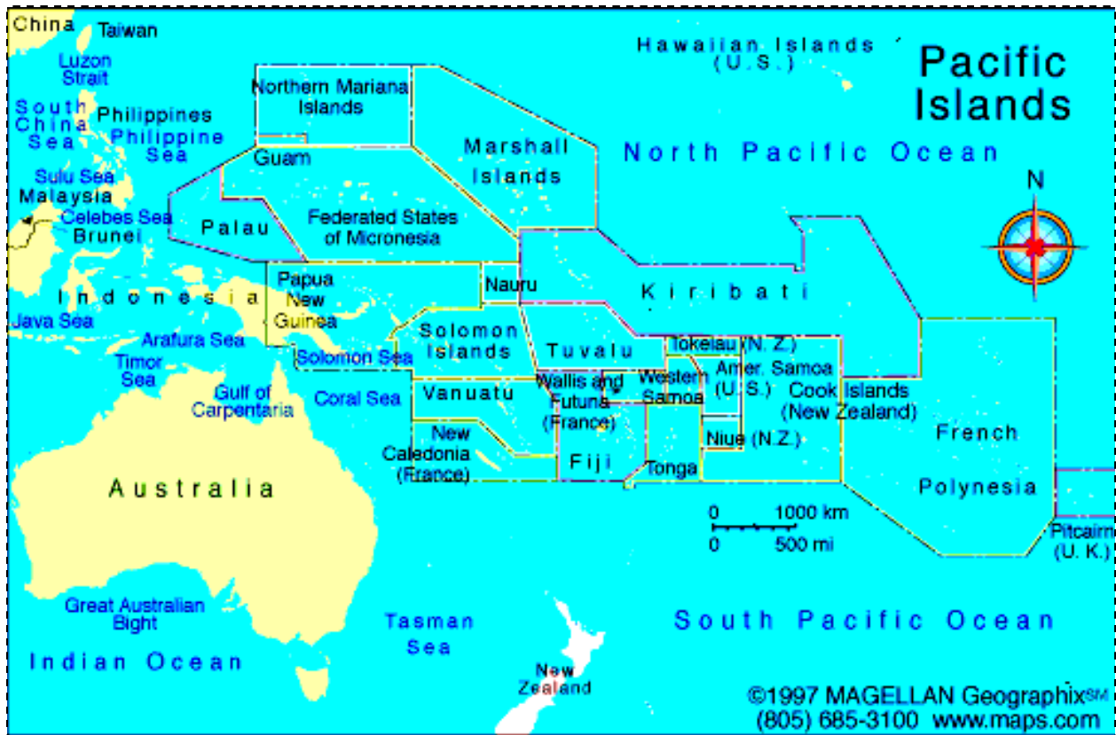
Figure 1: Location of the Pacific Island Countries and Territories (PICTs)