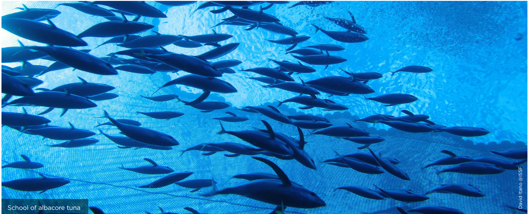
School of albacore tuna