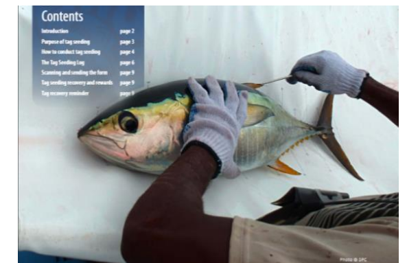
Tag seeding onboard purse seine vessels (NON-SECRET) A manual for observers