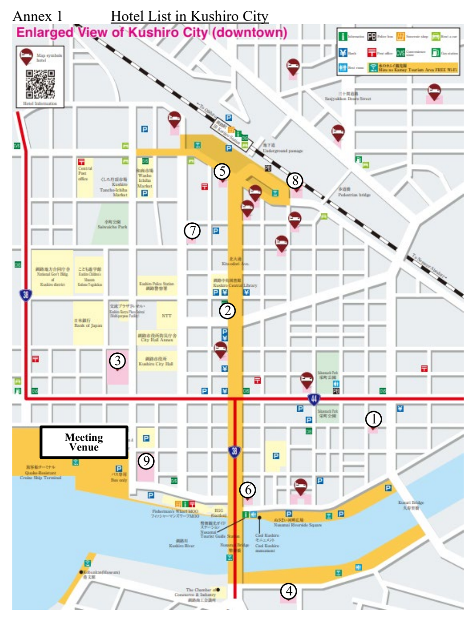
Hotel list - Only those with official English websites are listed. You can get the information on other accommodations at QR code on last page or here <u>pamphlet</u>.