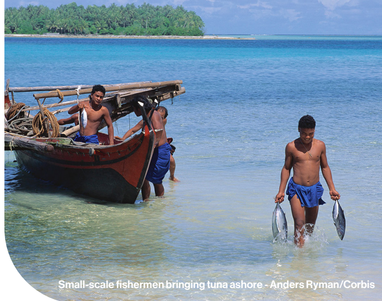
Small-scale fishermen bringing tuna ashore

Development of this funding proposal is supported by the GCF Project Preparation Facility grant, the Minderoo Foundation and USAID, and is expected to be completed by October 2024.