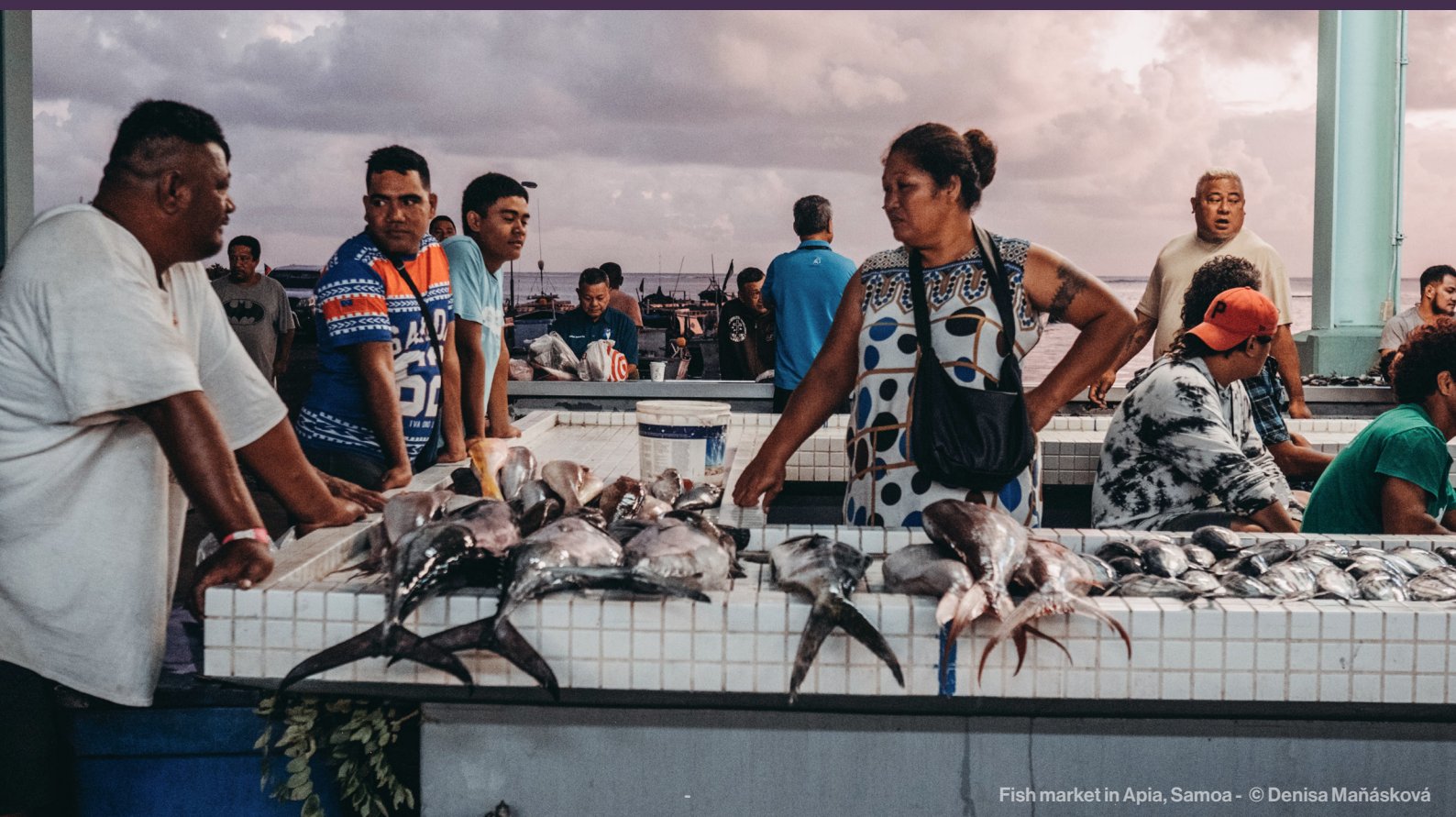
Fish market in Apia, Samoa

Climate change threatens to disrupt the traditional supply of fish for food security of Pacific Island people, and the vital contributions of tuna fishing to national economies