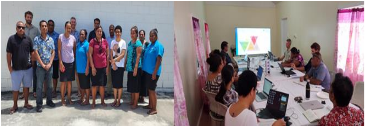
Harvest Strategy workshop participants and experts from SPC and FFA.

When Kiribati’s national borders re-opened, commercial flights also resumed. Kiribati (MFMRD) has communicated with SPC on the physical workshop and finally, the said workshop was held from 9-10 May 2023. The workshop was conducted successfully for 2 days. The 10 participants were from Kiribati’s Ministry of Fisheries & Marine Resources Development - Oceanic Fisheries Division. There were four (4) experts who conducted the workshop (3 from SPC and 1 from FFA).