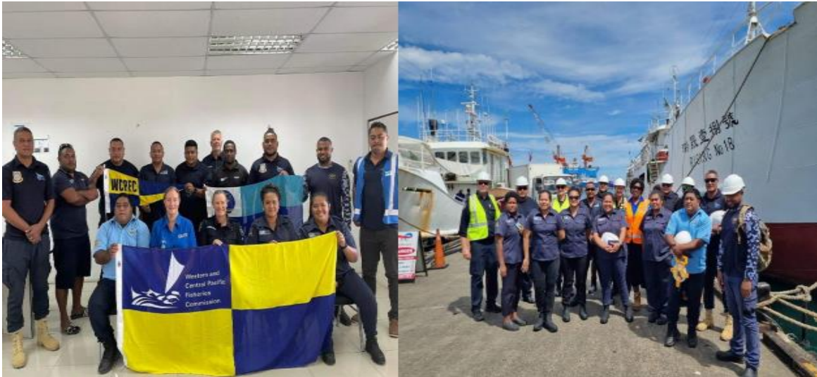
High Seas boarding and Inspection training 2 in Suva, Fiji Islands (24 th – 28 April 2023)

The second HSBI training was successfully implemented with more information and training materials and experiences shared among the facilitators to the participants. One highlight of the training is the practical exercise which was conducted in Mua-I Walu jetty with the assistances from Fiji Fisheries Boarding Officers. This exercise was conducted according to the HSBI procedures that was discussed in the training. The team managed to board two Longline vessels usually fish in the High Seas which was very useful to the application of HSBI procedures (CMM2006-08). The training was concluded with a great understanding and knowledge received by participants on HSBI process and procedures (CMM2006-08).