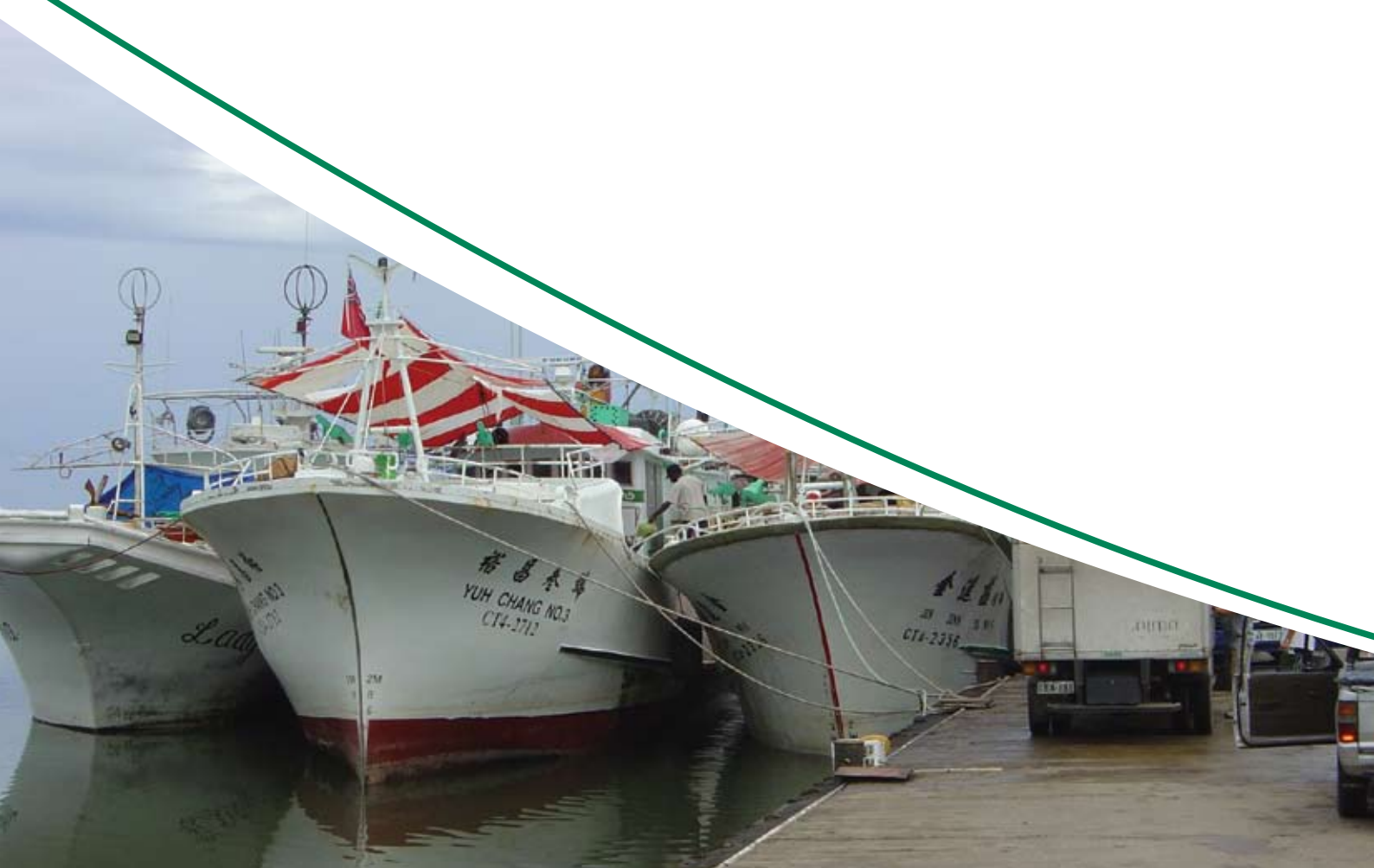
Longline fishing vessels berthed at the Fiji Fish Marketing Group Ltd jetty, Lami, Fiji.

WWF is one of the world's largest and most experienced independent conservation organizations, with almost 5 million supporters and a global network active in more than 100 countries.