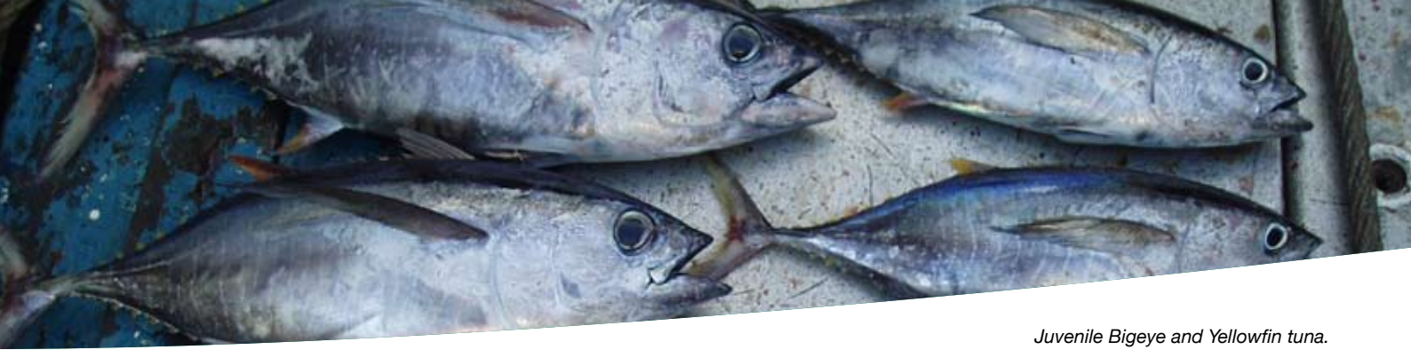
Juvenile Bigeye and Yellowfin tuna.

by States with national allocations. It would appear that States almost universally take the attitude that where the level of catch or fishing effort by their fleet exceeds their national allocation the only viable solution is to fight to gain an increased allocation – regardless of the conservation status of the target stocks or any wider environmental impacts of higher fishing activity.