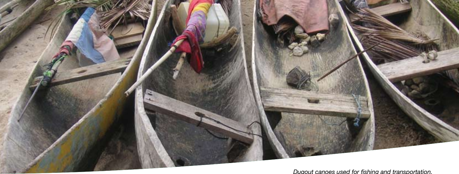
Dugout canoes used for fishing and transportation, Gizo, Solomon Islands.