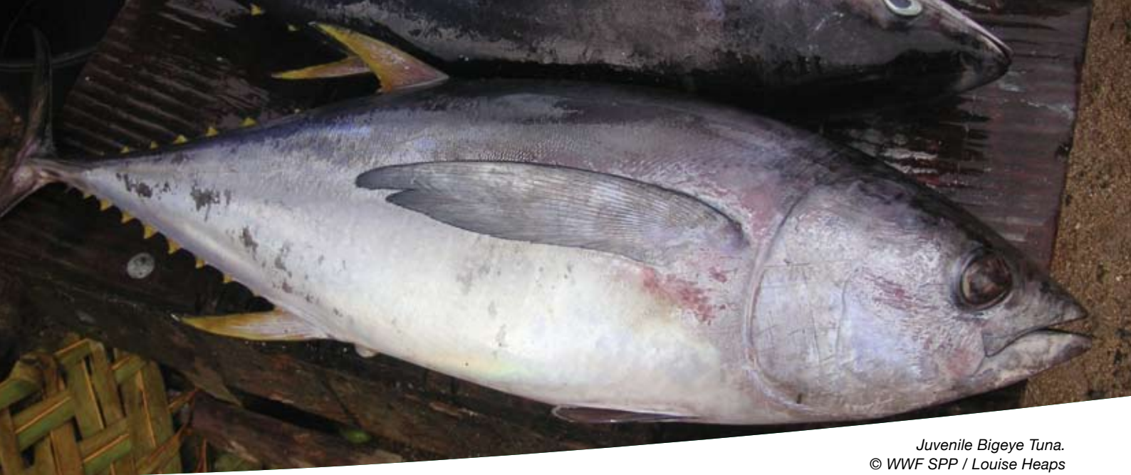
Juvenile Bigeye Tuna.

initiated a 'push back' by other FFA States on the VMS issue and subsequent increased uptake of the equipment (pers. obs.).