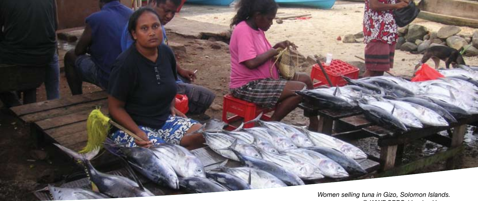
Women selling tuna in Gizo, Solomon Islands.

six key issues identified by the Chair for discussion at the fourth negotiating session, along with the Convention Area, minimum terms and conditions for fishing, enforcement, institutional arrangements, and decision-making and settlement of disputes (Anon., 1999).