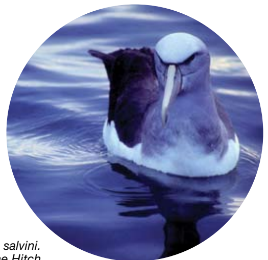
Salvins Albatross, Thalassarche salvini.