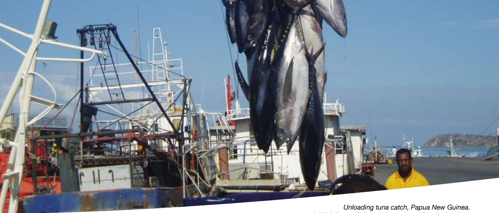
Unloading tuna catch, Papua New Guinea.

Clearly, allocations in and of themselves will not deliver the required conservation outcomes or stability for the fishery. If the integrity of the allocations is not supported by well-developed monitoring, control and surveillance measures, non-compliance can be expected to be high with resultant negative impacts on the resource. The ability to impose some form of sanctions or penalties linked to non-compliance with quotas, or indeed reductions in quota as a response to other breaches of Members' broader obligations, should be regarded as an integral component of any allocation of participatory rights. In addition, the impact on both target stocks and the broader marine environment of both the nature of the right and the dynamics of any transferability provisions will require constant monitoring.