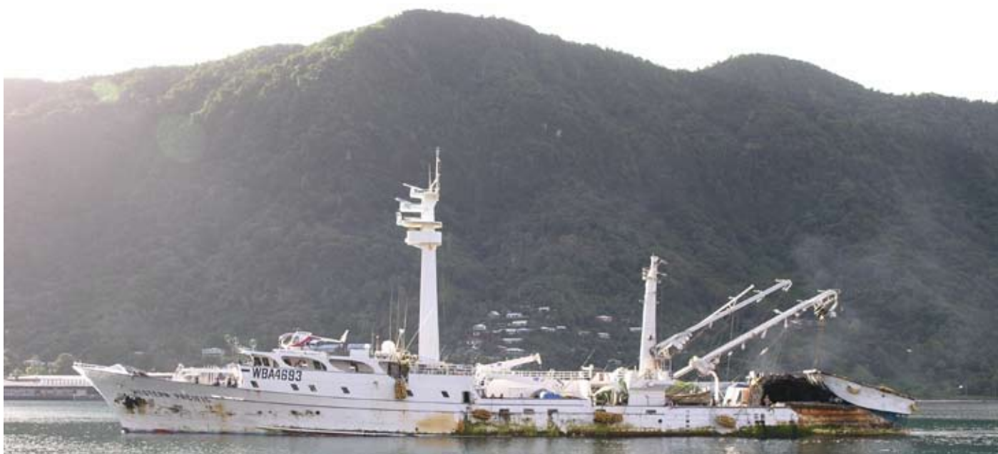
Purse Seiner, WCPFC Convention area.

Entering into force in June 2004, the Convention for the Conservation and Management of Highly Migratory Fish Stocks in the Western and Central Pacific Ocean resulted in the establishment of the most recent RFMO; the Western and Central Pacific Fisheries Commission (WCPFC). Allocation was highlighted as a crucial issue at the second negotiating session to establish the new convention, with the Chair's report stating that the Conference considered that allocation of allowable catch or levels of fishing effort was 'inextricably linked to the basic principles of conservation and management' (Anon., 1997). The issue of allocation was also one of