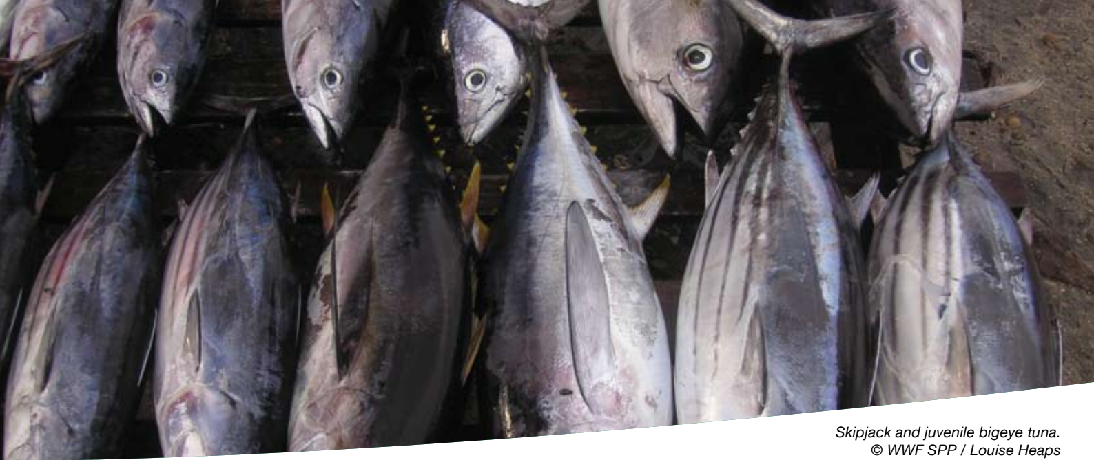
Skipjack and juvenile bigeye tuna.

management action in response to these warnings. The second session of the WCPFC responded to advice of declining stock status by agreeing to adopt a number of resolutions, including one on the reduction of overcapacity. The same session also adopted a number of binding Conservation and Management Measures for Bigeye Tuna and Yellowfin Tuna. The degree to which these measures will be successful in the absence of an effective allocation is unclear. The level of fishing effort and catch set under the measures is also a matter of concern. These issues will be considered later in this paper.