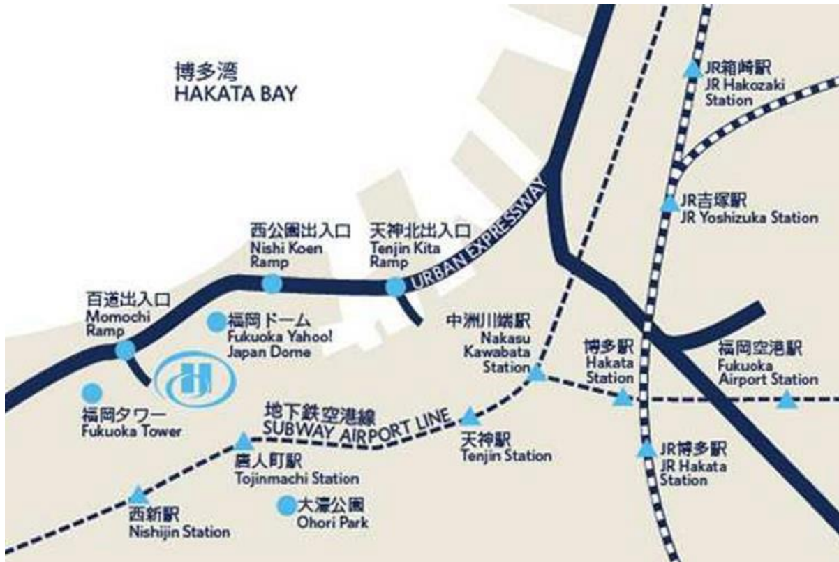
The map of the meeting venue, Hakata and Tenjin area