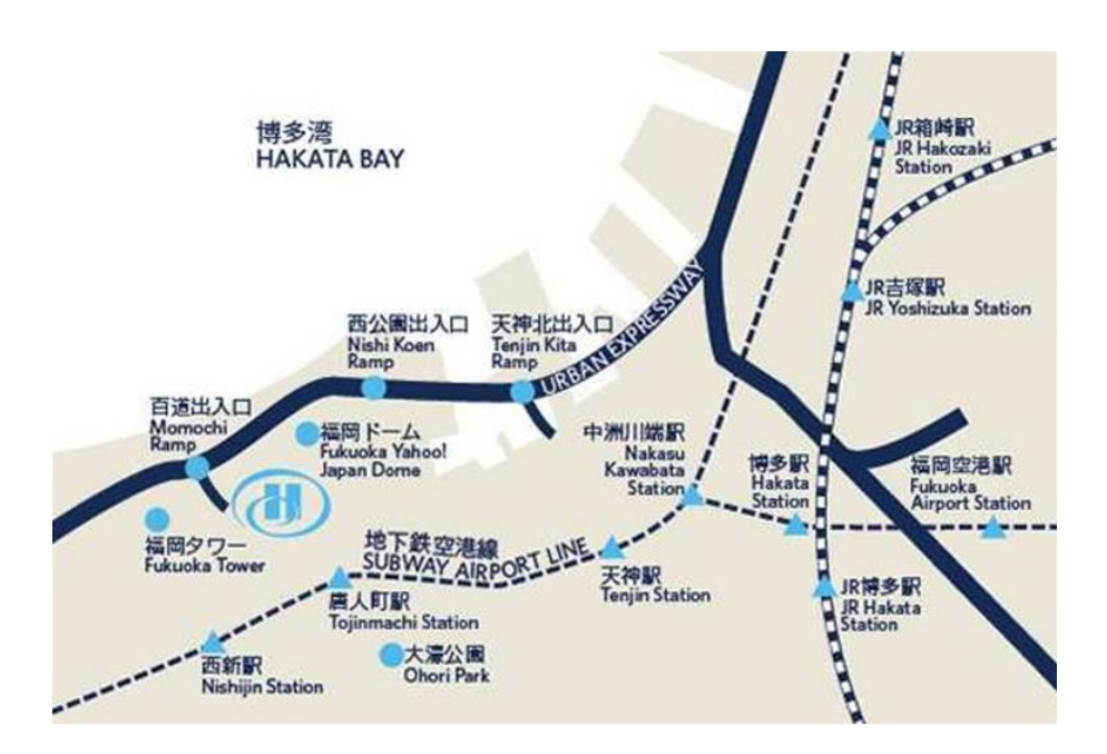
The map of the meeting venue, Hakata and Tenjin area