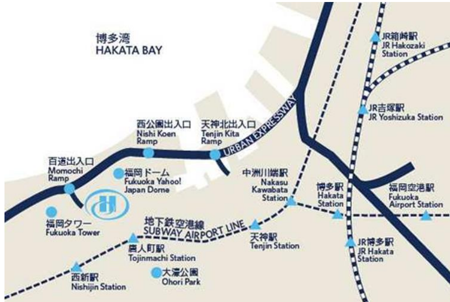
The map of the meeting venue, Hakata and Tenjin area