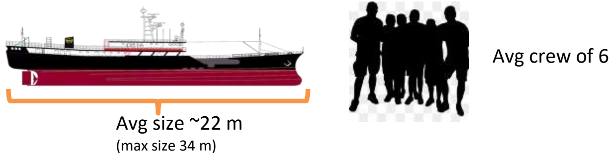
Figure 1 – Graphical comparison of vessel size and crew size of distant water (China, Chinese Taipei, Japan, Korea), Pacific Island (excluding Vanuatu), and the Hawaii and American Samoa fleets. Data from WCPFC Record of Fishing Vessels.